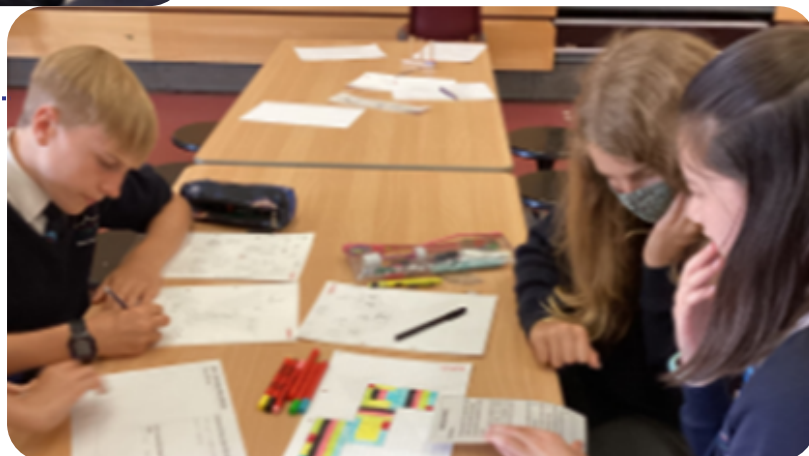
Year 7 Students

At a local level, a team of Year 7 and Year 8 students from West Exe School participated in the Exeter Maths Challenge cup at St James' School and won!