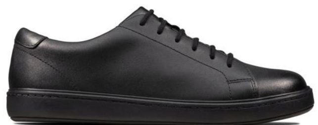
Not permitted due to the sole and overall similarity to Vans style