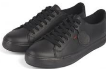
No Converse or Vans style