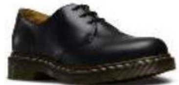
With coloured stitching